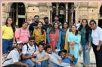
NORTH INDIA TRIP